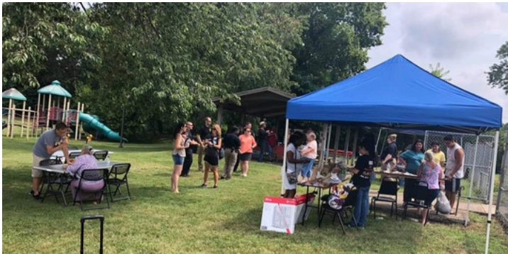
Summer Block Party co-hosted with City of Bowling Green