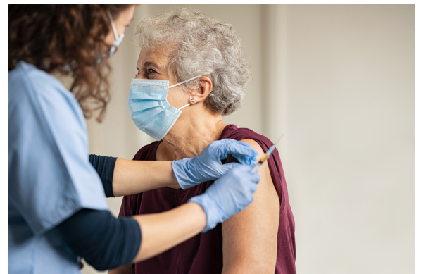
Assisted with COVID -19 vaccine clinics